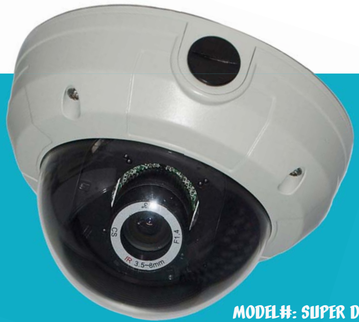
MODEL#: SUPER DOME

Here is a Vandal Proof Day/Night Dome Camera for less than $100! It comes standard with a metal housing, a varifocal lens, and conduit opening. Put it inside offices, hallways, even outside to get a crystal clear picture day or night.